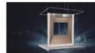
All aluminum alloy sink cabinet