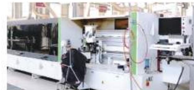
Italy Biesse crawler type high speed edge banding machine

It can realize the functions of automatic gluing, edge sealing, head trimming, finishing, polishing and so on, 25 meters per minute