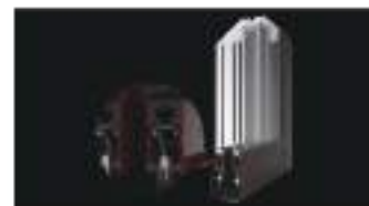
Shockproof and dustproof sealing tape