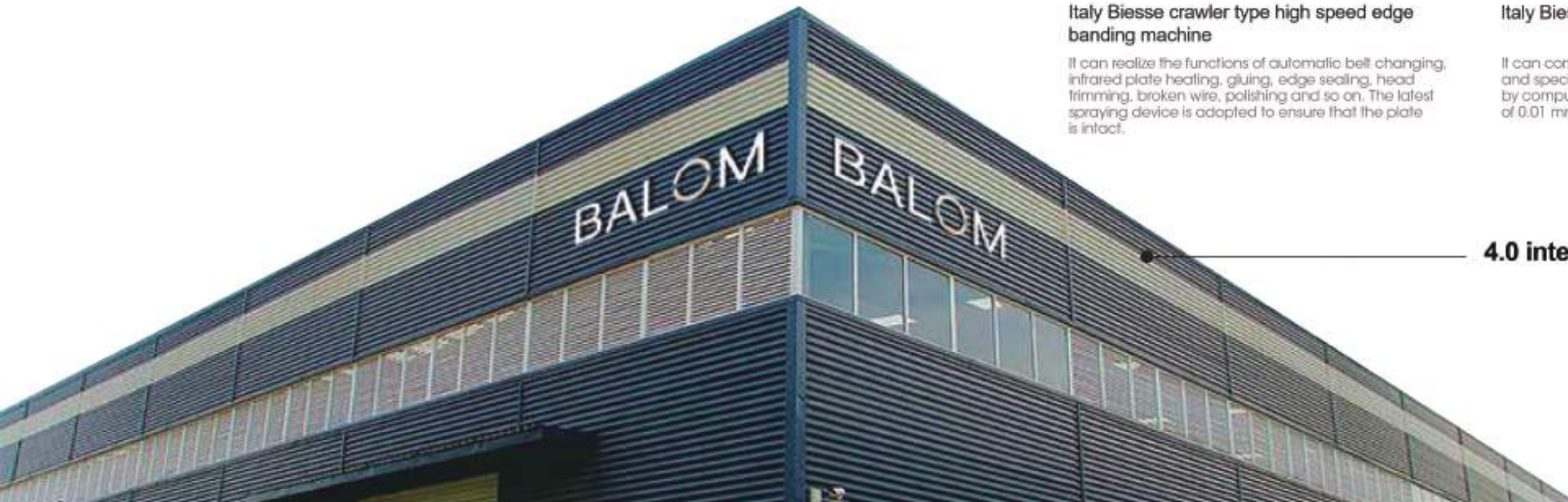
4.0 intelligent chemical plant

It can complete automatic hole arrangement milling and special modeling processing, which is controlled by computer, and the accuracy can reach to the level of 0.01 mm