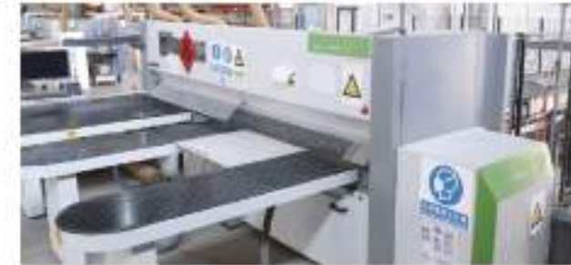
Italy Biesse heavy duty electronic cutting saw wnt610

Full set of introduction of Germany Homag, Italy Biesse and other professional production equipments, with information management to achieve the "Seiko" to create "Seiko quality, China intelligent made" cost competitive advantage.