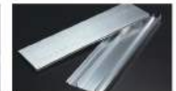
Aluminum brushed toe kick