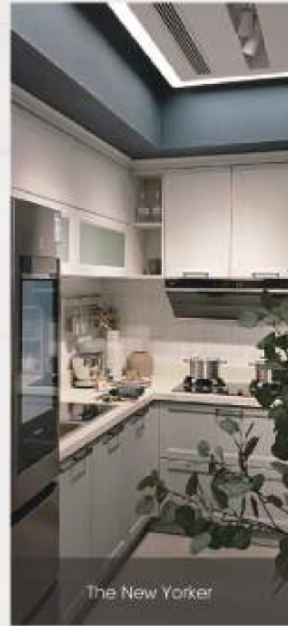
The New Yorker