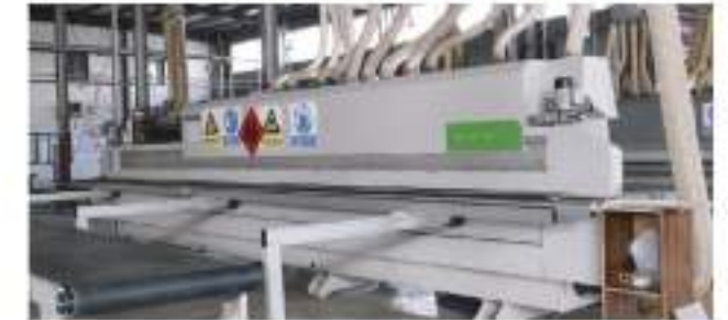
Italy Biesse heavy-duty high-speed linear edge banding machine STREAM

The automatic NC rear feeding system can cut plates up to 160mm thick at one time.