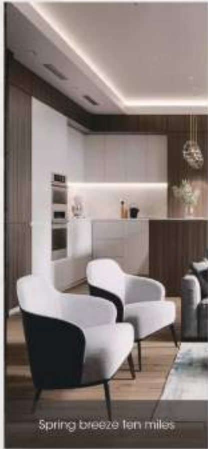
Spring breeze ten miles