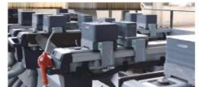
Italy Biesse CNC machining center skip100

It can realize the functions of automatic belt changing, infrared plate heating, gluing, edge sealing, head trimming, broken wire, polishing and so on. The latest spraying device is adopted to ensure that the plate is intact.