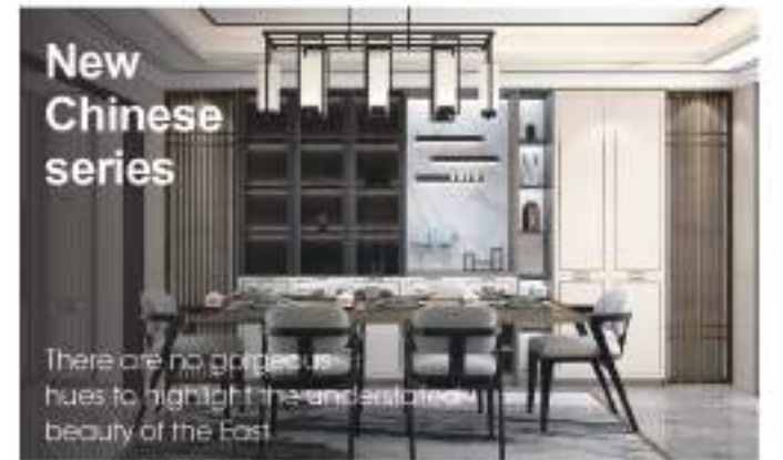
New Chinese series

I hope this product can bring users a good time in life