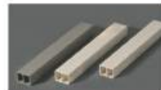
New PVC cushion strip