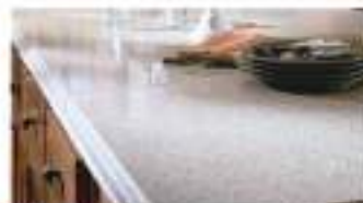
Anti pollution and anti crack table